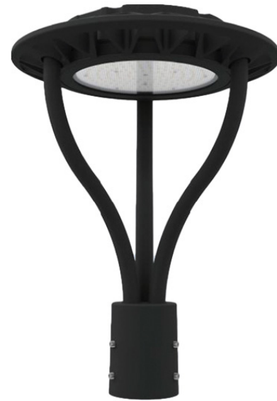
Tunable 150W Max Models