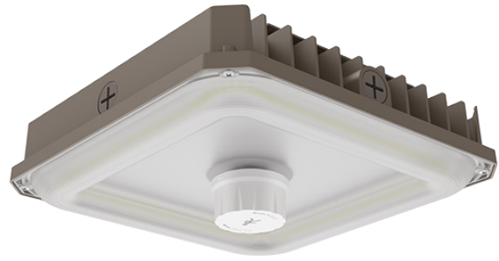
Tunable 80W Max and 100W Max Models