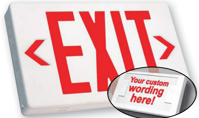
Custom Signage Available

* Special voltage & SALIDA face plate options available 1 Available only with EM units. 2 Available only with AC units.